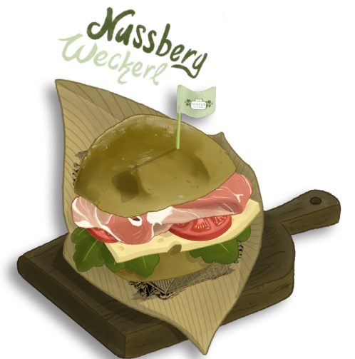
per bread € 8,90

LEGENDARY- PATTY ...with our legendary minced patty from Mayer's Heurigen kitchen. A, C, L, M